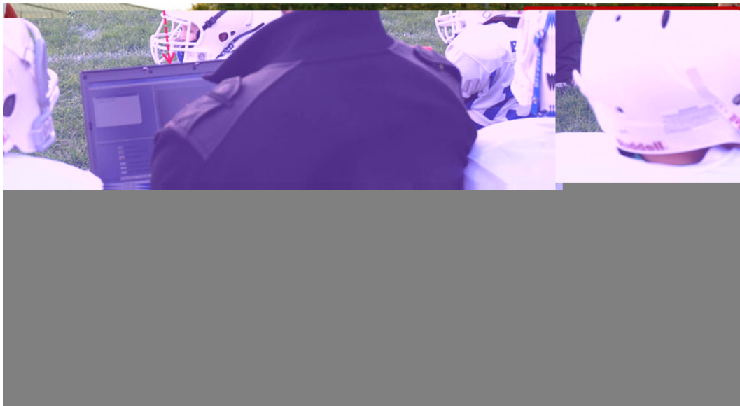
FIGURE 1. The helmets of youth football players were instrumented with the 6DOF head acceleration measurement device. Players wore instrumented helmets for every game and practice they participated in. Each time an instrumented player experienced a head impact, data were collected and then wirelessly transmitted to a computer on the sideline.

The 6DOF measurement device consists of 12 accelerometers and is designed to integrate into Riddell Revolution football helmets (Fig. 1). While the 6DOF measurement device was originally designed for adult Revolution football helmets, the device is compatible with youth helmets due to the same sizing conventions and identical padding geometries between adult and youth Revolution helmets. Instrumented helmets were worn by youth football players during each game and practice they participated in. Each time an instrumented helmet was impacted and an accelerometer exceeded a specified threshold, data acquisition was automatically triggered. A total of 40 ms of data from each accelerometer were recorded, including 8 ms of pre-trigger data. Once data acquisition was complete, data were wirelessly transmitted to a computer on the